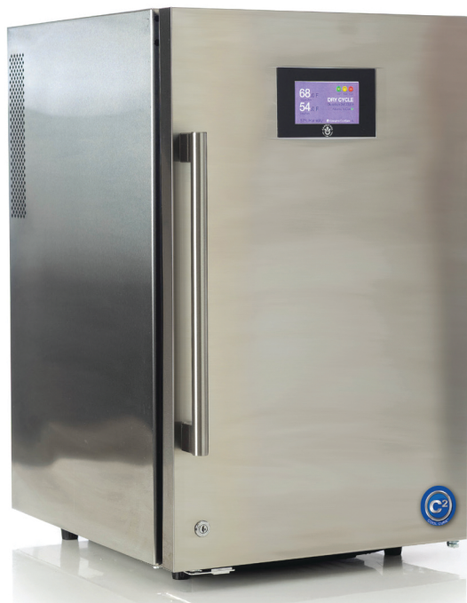
The Cool Cure C2 | MSRP