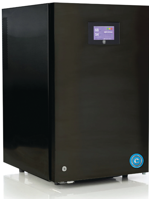
The Cool Cure C | MSRP